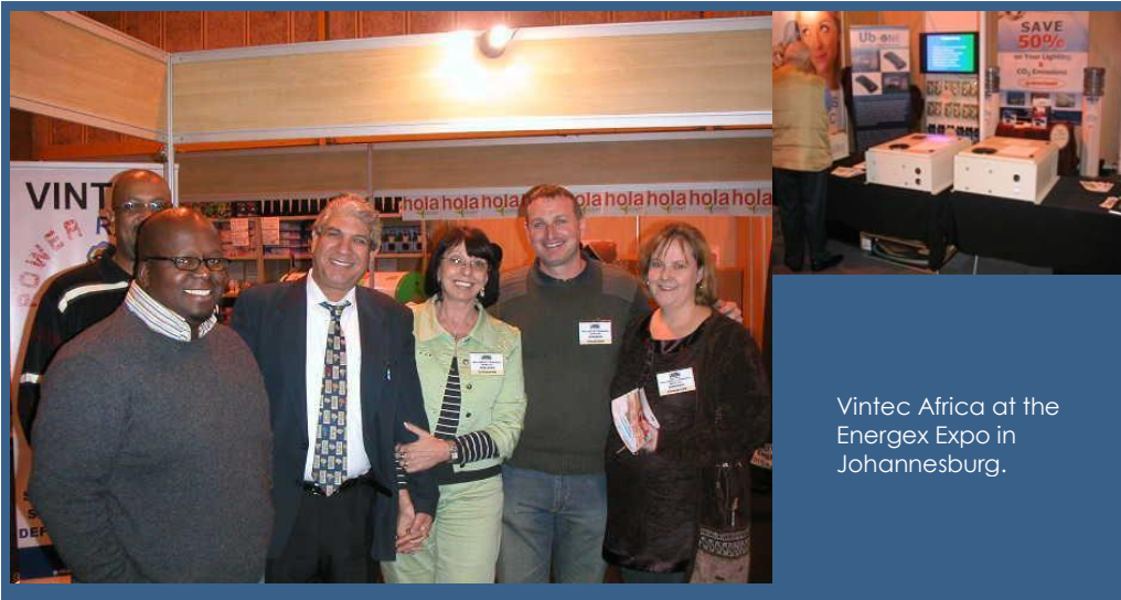
Vintec Africa at the Energex Expo in Johannesburg.