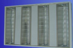
T5 Grille – More Energy Efficient than the T12/T8 Fluorescent

“Save up to 50% by replacing your T12/T8 Fluorescent Lighting with the New T5.”