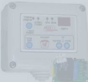
“ Power Save ” People Presence Sensor